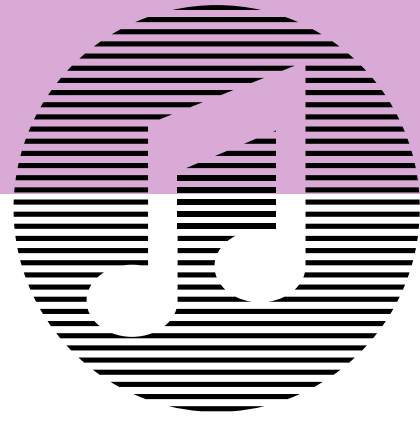
Table of Keys, notes and numbers